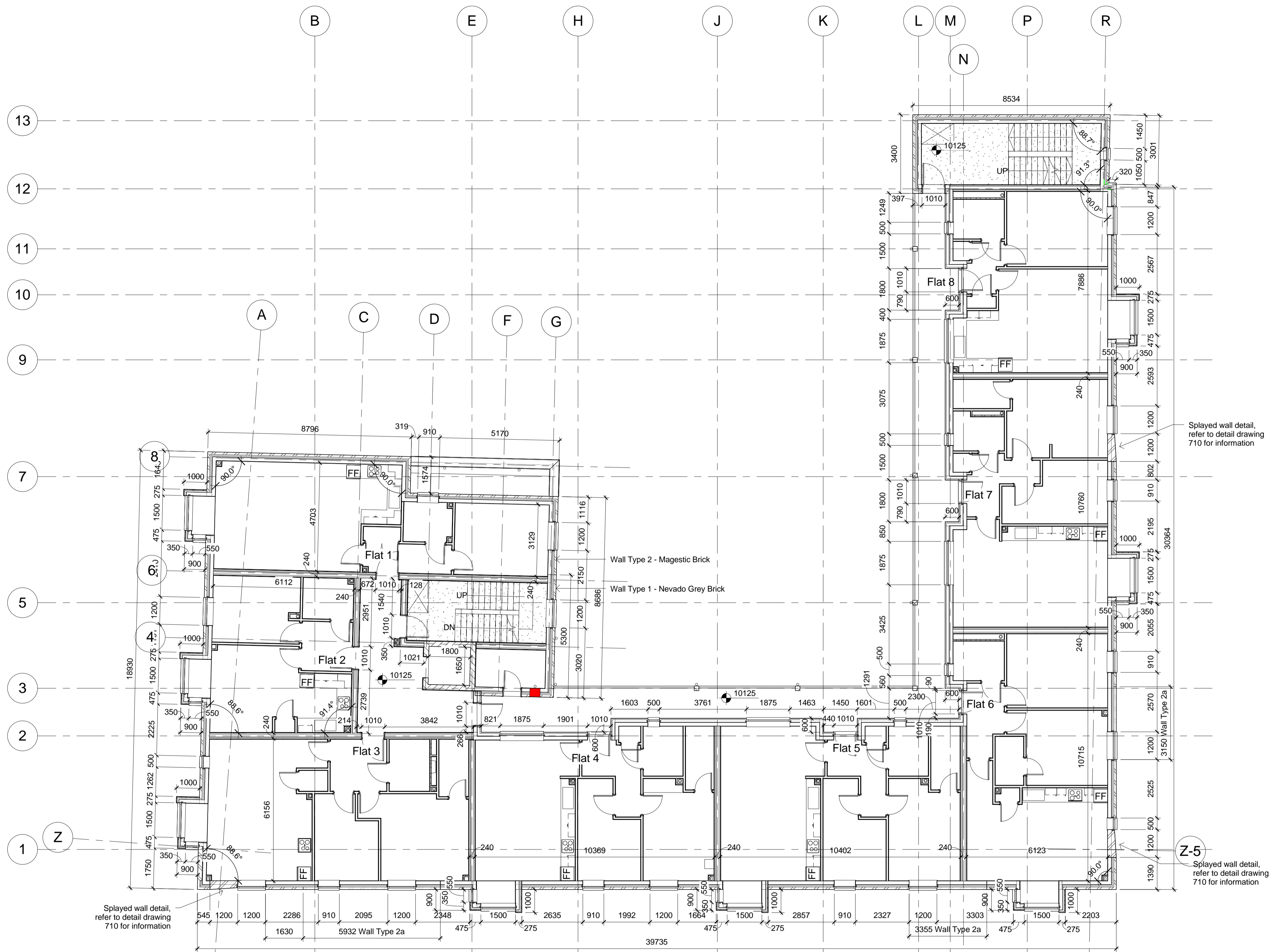
1 Dimensions Level 1 1 : 100